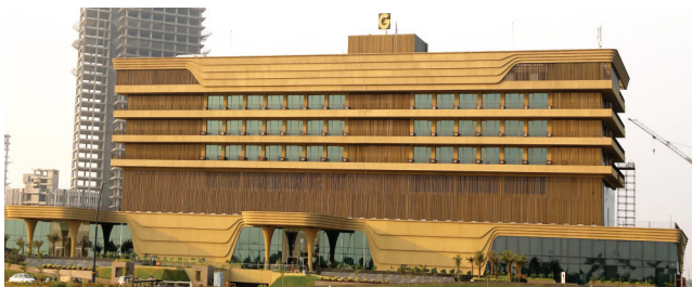
GIFT City Club