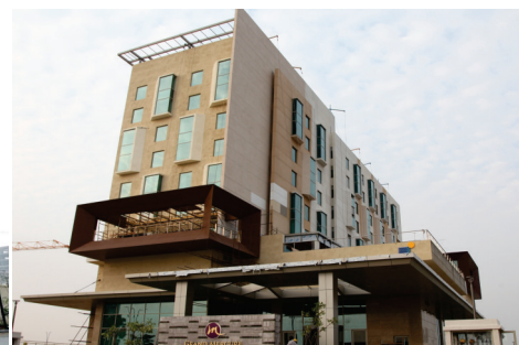
Brigade Hotel "Grand Mercure"