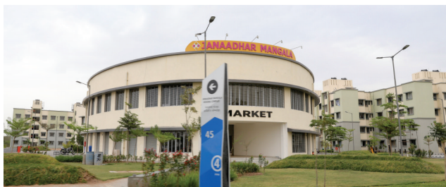
Janaadhar Affordable Housing